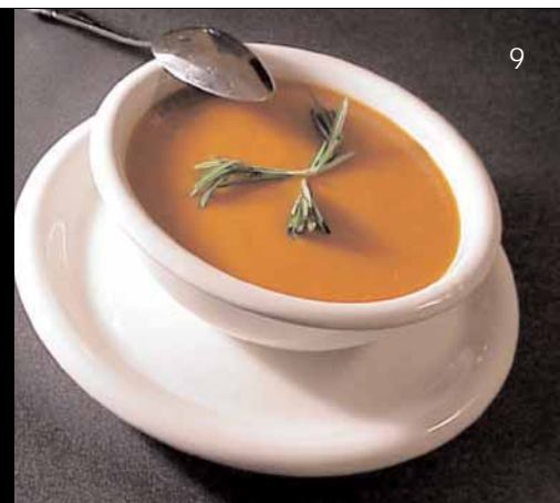
Recipe favorite submitted by Drai Bearwomyn

Salt and pepper to taste. Garnish with cilantro (optional). This is a recipe to play with. If you want it thicker or thinner, play with the amount of liquids you add at the end. Delicious hot or cold.